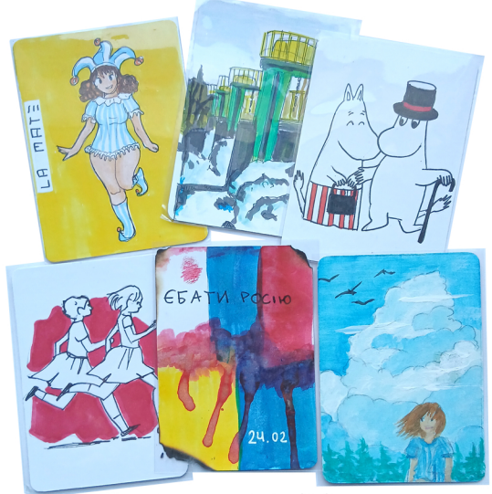
GODAI, MARCH 2026