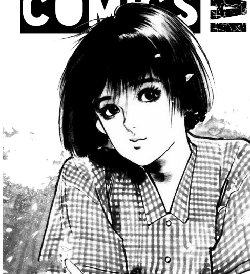
PIONEERING MANGA IN THE WEST

BUT WHEN MAKING A MASS PRODUCT, YOU NEED TO APPEAL TO THE MASS AUDIENCE. OTHERWISE, YOU HAVE TO EXPECT FAILURE. "MAI, THE PSYCHIC GIRL" APPEALED TO THE MASS AUDIENCE VERY STRONGLY, AND THAT'S GREAT.